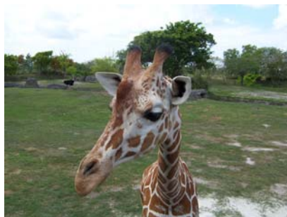
A gentle giraffe

I was very impressed. I know that some purists will decry the exhibit, saying that zoo animals should be seen in their natural habitat, or as near to it as possible, but I think exceptions can be made. I'm not crazy about circuses with acrobatic bears and dancing elephants, but I do like opportunities to interact with other species.