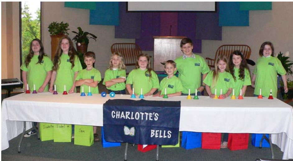
Our Children's Bell Choir receives a round of applause on Sunday, May 17, Children's Appreciation Day!